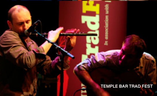
TEMPLE BAR TRAD FEST