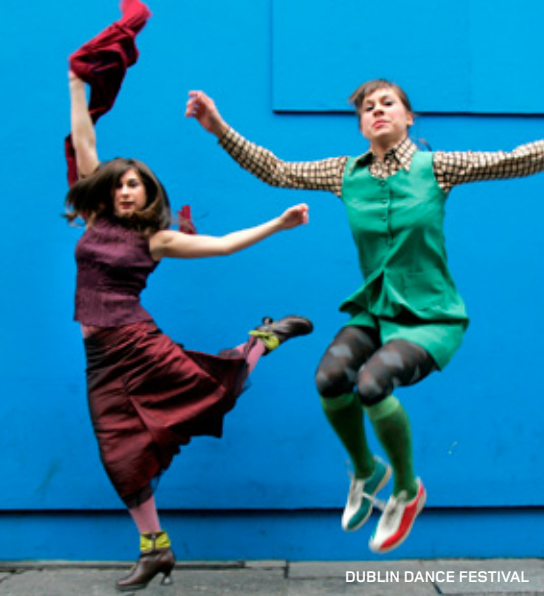
DUBLIN DANCE FESTIVAL