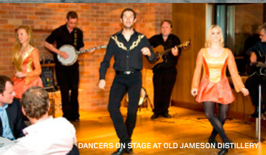
DANCERS ON STAGE AT OLD JAMESON DISTILLERY